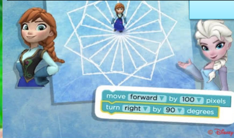
Code with Anna and Elsa

Let's use code to join Anna and Elsa as they explore the magic and beauty of ice. You will create snowflakes and patterns as you ice-skate and make a winter wonderland that you can then share with your friends!